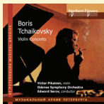
Northern Flowers NF/PMA 9947