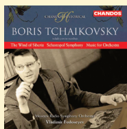
Chandos CHAN 10299H

Sebastopol Symphony Music for Orchestra The Wind of Siberia Moscow Radio SO Vladimir Fedosyeyev