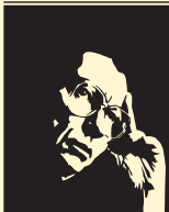
The Boris Tchaikovsky Society

"I consider him to be a genius [...]. I do think that one day people will come to know that two great Russian composers bore the same name..." — Mstislav Rostropovich