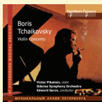
Northern Flowers NF/PMA 9947