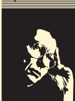
The Boris Tchaikovsky Society

"I consider him to be a genius [...]. I do think that one day people will come to know that two great Russian composers bore the same name..." — Mstislav Rostropovich