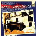
Melodya MEL CD 1000944

Cello Sonata / Lyrics of Pushkin Partita for Cello & Chamber Ensemble Mstislav Rostropovich (cello) Galina Vishnevskaya (soprano) Boris Tchaikovsky (piano, harpsichord)