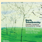
Hyperion Records CDA67413

Six Etudes for Strings & Organ Sinfonietta / Chamber Symphony The Bells