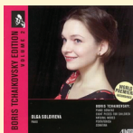
Albany Records TROY749