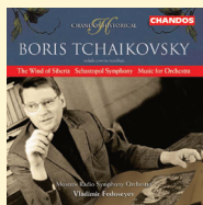
Chandos CHAN 10299H